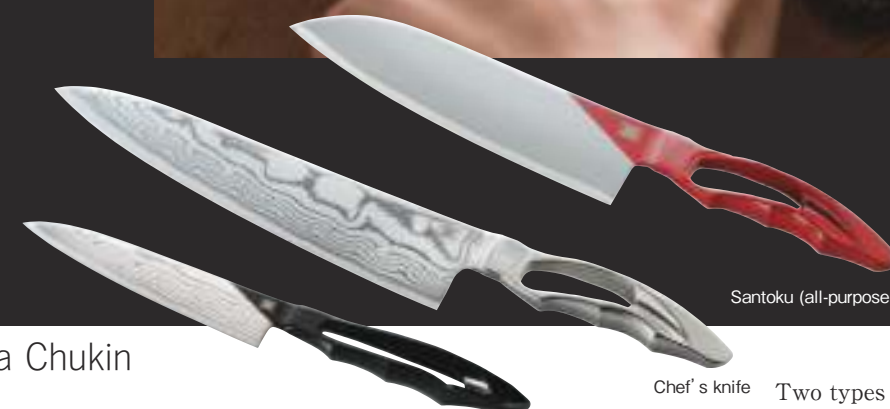
Santoku (all-purpose kitchen) knife

the hand – Rougata Chukin (wax mold casting)