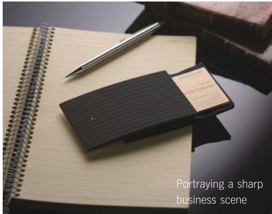
Portraying a sharp business scene