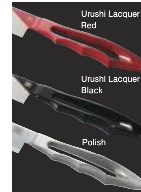
Urushi Lacquer Red