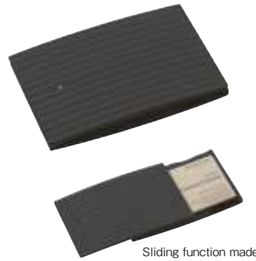
Sliding function made with metal parts